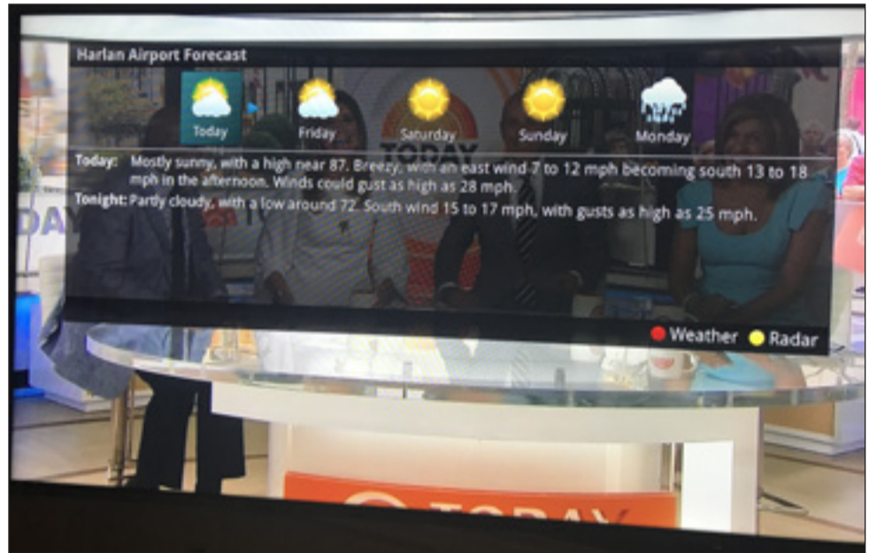
Customers can view the 5 day forecast by pushing the GREEN button on the remote.