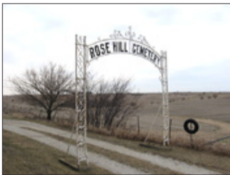
Brush and trees will be removed and the barbed wire fencing will be replaced with a new white fence as funds are raised.

It has served generations of families over the span of its 123 years. Today, it is an irreplaceable part of the Kirkman community. It is a place of history and honor for, to date, over 640 loved ones including 51 veterans (5 Civil